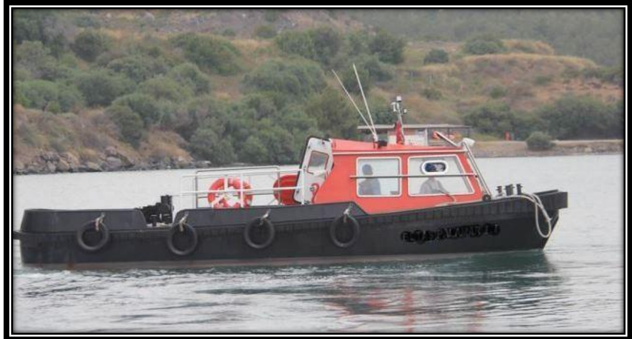
9,90 m. boat .